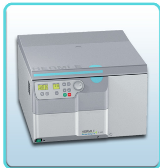
Z446 Universal Centrifuge