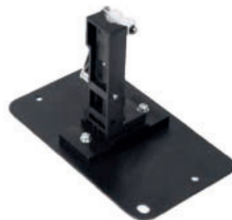
Cat. No. 18900338 Test tube holder(ø8-ø22mm)