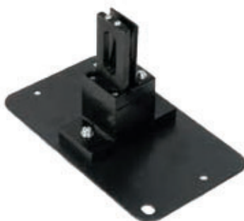
Cat. No. 18900339 solid sample holder (ø1.5-3mmø1 position)