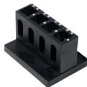
Cat. No. 18900331 4-cell holder for 10mm squ.cuvette