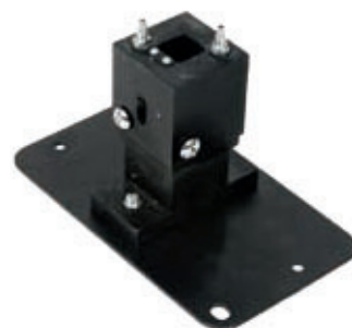
Cat. No. 18900335 10mm water-jacketed (for SCI-V1100 & SCI-UV1100)