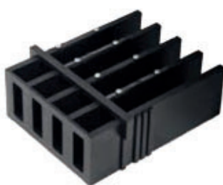
Cat. No. 18900333 4-cell holder for up to 100mm squ.cuvette