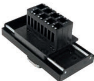
Cat. No. 18900340 8-position auto cell changer (for SCI-V1100&SP-UV1100)