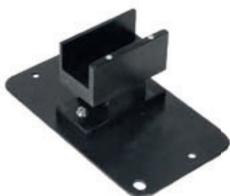
Cat. No. 18900334 cylindrical cell holder(ø16mm)