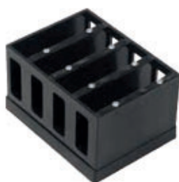
Cat. No. 18900332 4-cell holder for 10mm to 50mm squ. cuvette