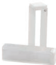
Square cuvettes glass/quartz 1-5mm/10-100mm