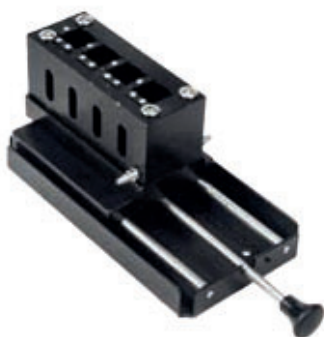
Cat. No. 18900336 10mm water-jacketed 4-cell holder (for SCI-V1100 & SCI-UV1100)