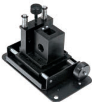
Cat. No. 18900337 Micro Cell holder