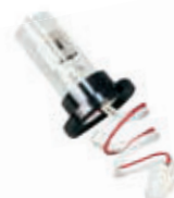
Cat. No. 18900342 Milas deuterium lamp,10V,300mA, 30W (for SCI-UV1000 & SCI-UV1100)