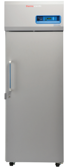
Thermo Scientific™ TSX 23 cu. ft. freezer