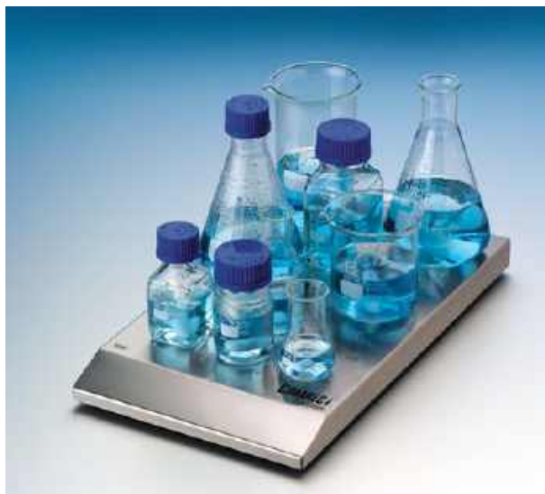
Cimarec i Telesystem Multipoint Stirrer

Operating conditions: -10° to +56°C at 100% RH in air; 0° to 50°C submerged in water. 100-240 V units contain a cord set with various plugs