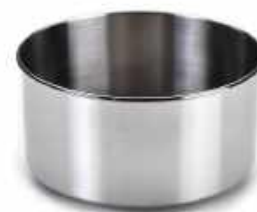
Heating Bath for RT2 Digital Hotplate