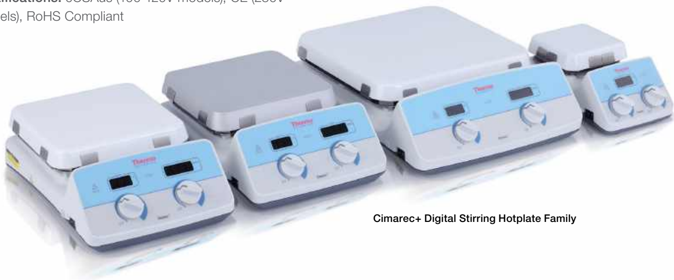
Cimarec+ Digital Stirring Hotplate Family

Certifications: cCSAus (100-120V models), CE (230V models), RoHS Compliant