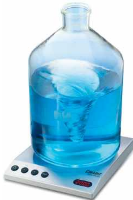
Cimarec Power Direct High Capacity Stirrer