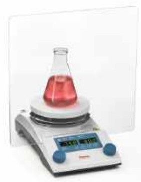
RT2 Digital Hotplate with transparent shield