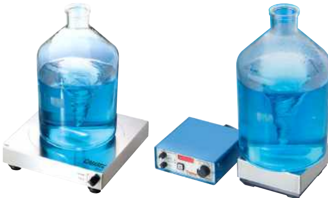
Cimarec Mobil Direct Stirrers