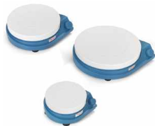
RT Basic Series Magnetic Stirrers

Certifications: cCSAus (100-120V models), CE (230V models), RoHS Compliant