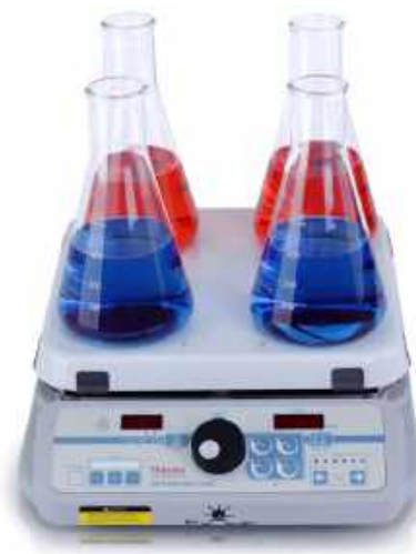
Super-Nuova Multi-Position Digital Stirrer

Certifications: cCSAus (all models), CE (220-240V models)