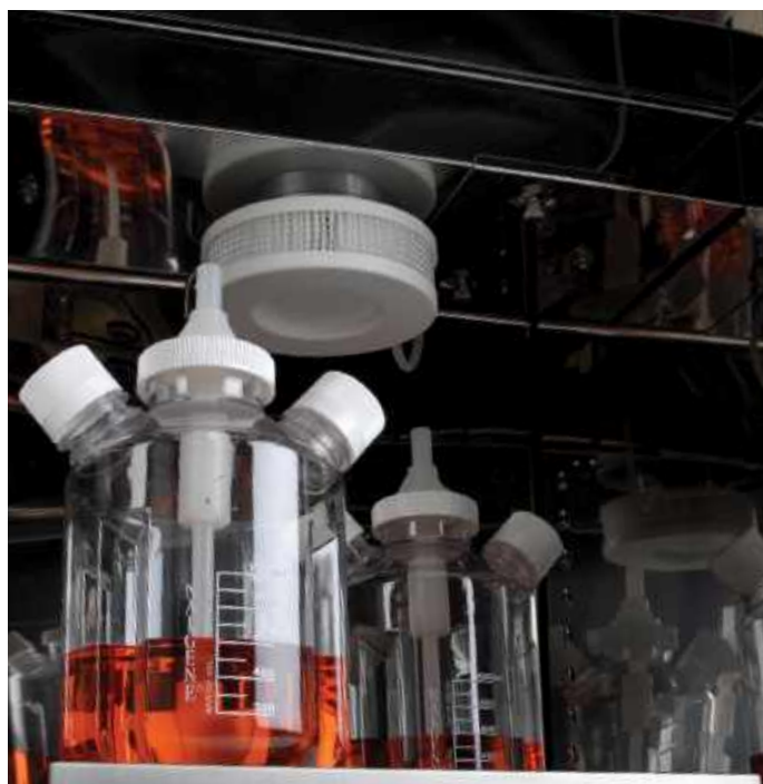
Cimarec i Biosystem Slow Speed Stirrer

Operating conditions: -10 to +56°C at 100% rH; 100-240V units contain a cord set with various plugs