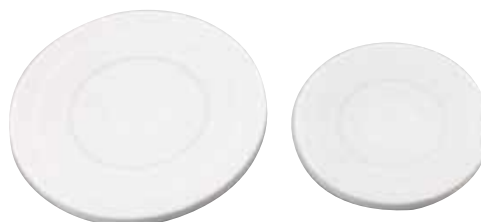
Non-slip silicone plate covers

Certifications: cCSAus (100-120V models), CE (230V models), RoHS Compliant