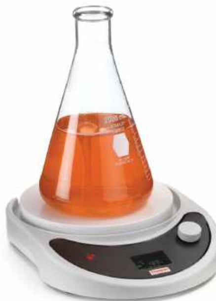
RT Touch Series Magnetic Stirrer

Includes: Stir bar and two non-slip silicone plate covers (1 black, 1 white)