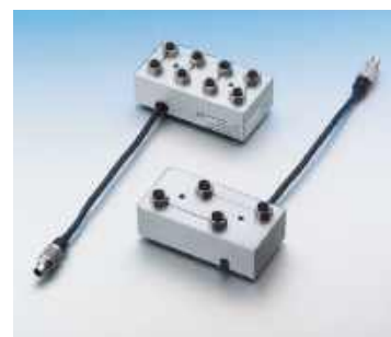
Cimarec i Benchtop Distributors