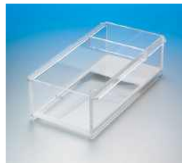
Cimarec i Bath Mounts