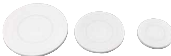
Non-slip silicone plate covers