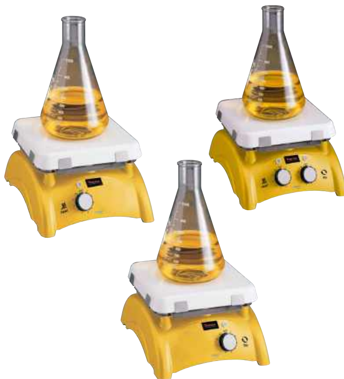
Cimarec Basic Hotplate and Stirring Hotplates