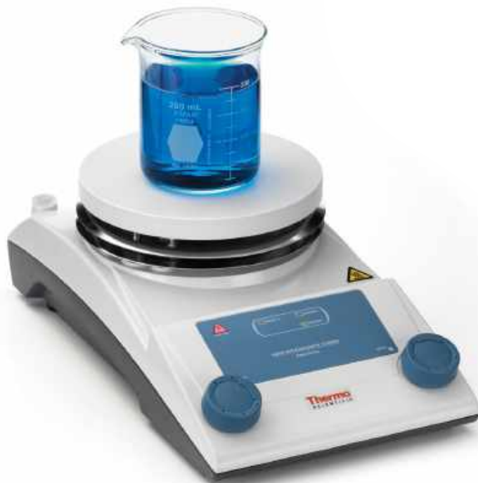
RT2 Basic Hotplate Stirrer

Optional: Non-slip heating bath, transparent shield and supporting rod