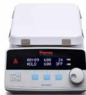
Super-Nuova+ Stirring Hotplate

Includes: PT100 Temperature probe, supporting rod and clamp kit (only for hotplates and stirring hotplates); Stir bar (only for stirrers and stirring hotplate)