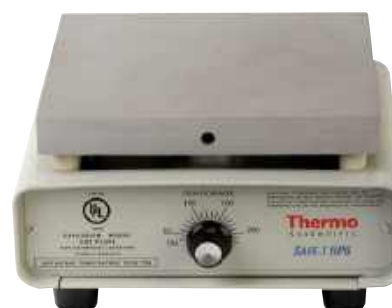
Explosion-Proof SAFE-T HP6 Hotplate

Includes: Stirrer unit and one 2 × 0.38 in. (5 × 1cm) PTFE-coated stir bar