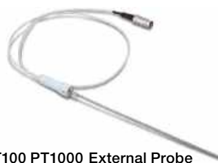
PT100 PT1000 External Probe