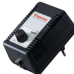
Cimarec i Standard Teleomodul Controller