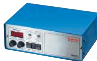
Cimarec 40B Telemodul Controller