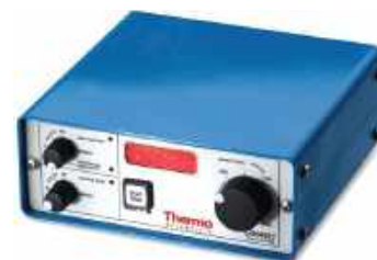
Cimarec 40M and 80M Controller