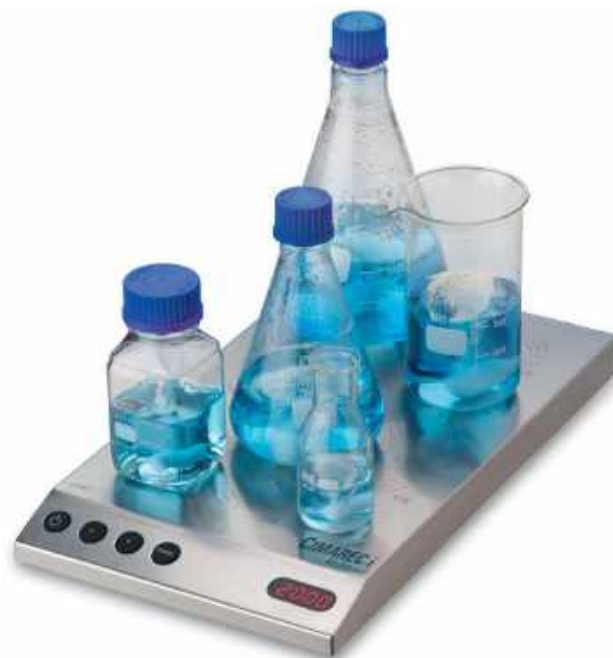
Cimarec i Multipoint 15 Stirrer

Operating conditions: -5 to +40°C at 95% rH; 100-240 V units contain a cord set with various plugs