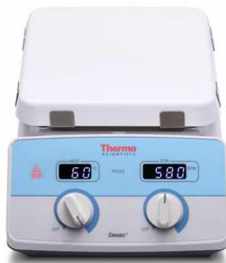
Cimarec+ Digital Stirring Hotplate

Includes: Stir bar (*only for stirrers and stirring hotplate models)