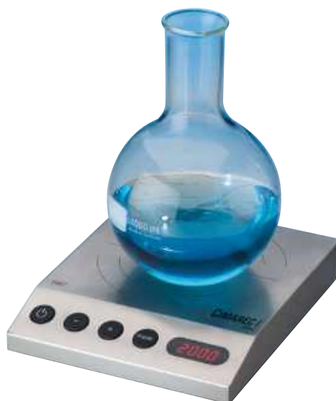
Cimarec i Maxi Direct Stirrer

Operating Conditions: -10° to +40°C at 95% RH. 100-240V units contain a cord set with various plugs.