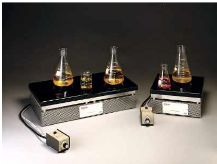
Large External-Controller Hotplates