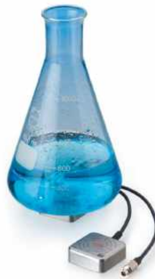
Cimarec i Micro Stirrer