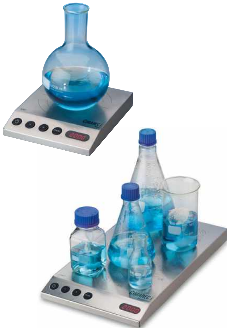
Cimarec i Magnetic Stirrers