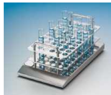
Cimarec i Test Tube Rack