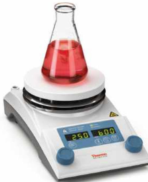
RT2 Advanced Hotplate Stirrer

Includes: Temperature probe (PT100, B Class)