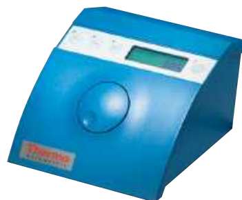
Cimarec i Teleomodul 40C and 20C Controller