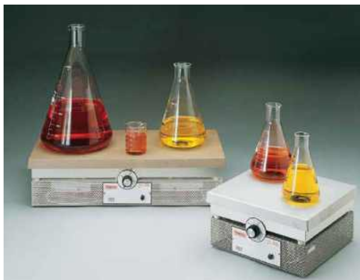
2200 Series Aluminum Top Hotplates

Alert: Recommended for use with glass vessels only