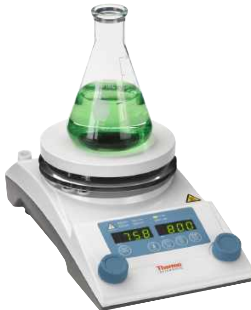
RT2 Digital Hotplate

Optional: Non-slip heating bath, transparent safety shield