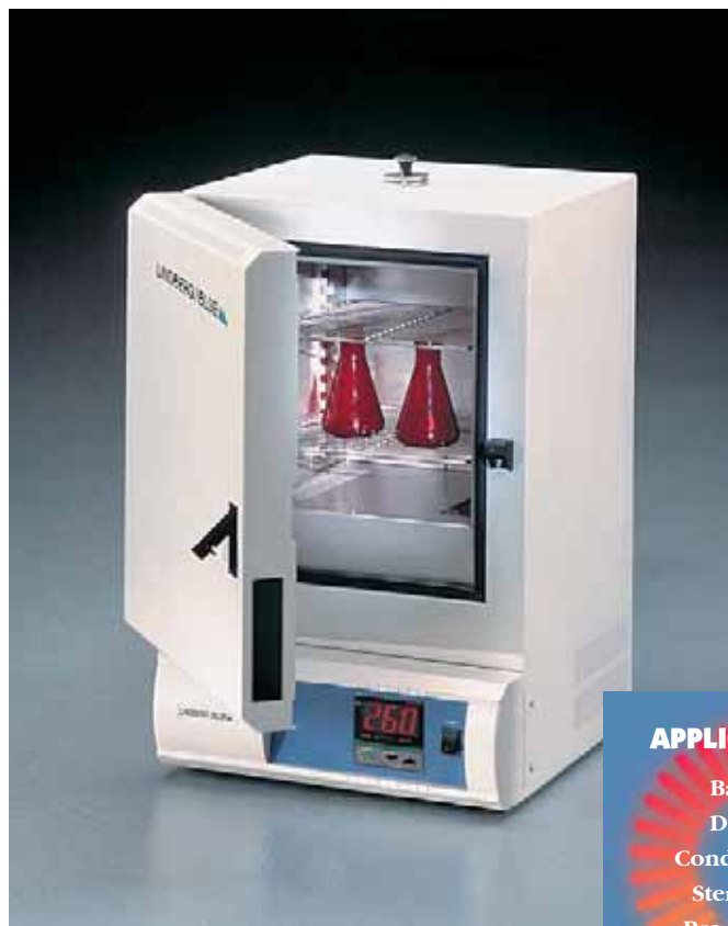
Deluxe Series 260°C gravity convection ovens are available in five sizes with stainless steel or painted exterior finishes. Model GO1310A, shown.