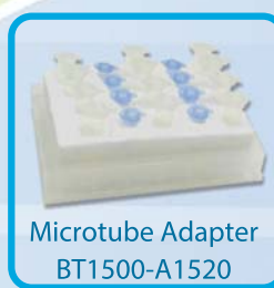
Microtube Adapter BT1500-A1520

Designed for application flexibility, the Incu-Mixer series is available in two, and four-plate capacities. The four-plate model features an increased chamber height for accepting plates up to 46mm high. Independent time, temperature and speed controls allow the mixer to function as 3 machines in one; a multi-plate incubator, vortexer, or a combination of the two. The Incu-Mixer MP series is ideal for a wide variety of molecular biology applications including immunochemical reactions, enzyme and protein analysis, and microarray analysis.