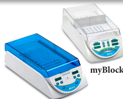
myBlock™ Dry Baths