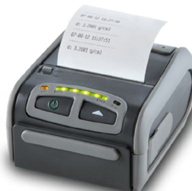
Thermal Printer Order No. W3130

The W3130 Thermal Printer offers a small footprint, modern design, and is compatible with Accuris series Dx and Tx Analytical Balances. Connection is easy with the included cables, and weight values and other critical info can be printed quickly and clearly. The W3130 printer connects to AC power (100V to 240V) with an included power adapter, and also features an included rechargeable Li-Ion battery.