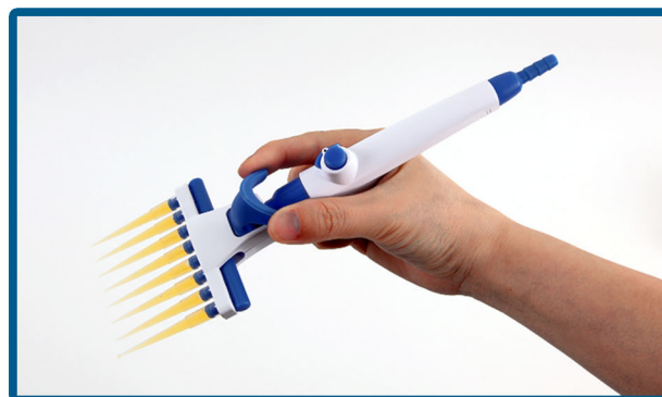
Shown with 8 Channel Pipette Tip Adapter (V0020-8)