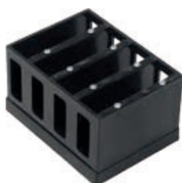
Cat. No. 18900332 4-cell holder for 10mm to 50mm sq. cuvette