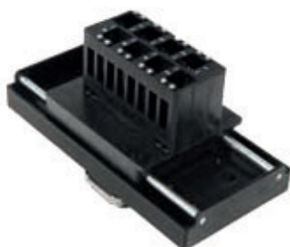
Cat. No. 18900340 8-position auto cell changer (for SCI-V1100&SP-UV1100)