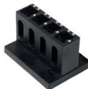
Cat. No. 18900331 4-cell holder for 10mm sq. cuvette