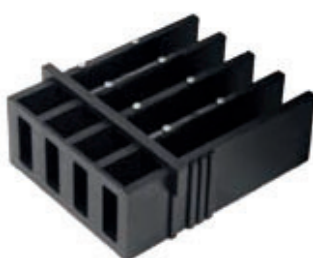
Cat. No. 18900333 4-cell holder for up to 100mm sq. cuvette