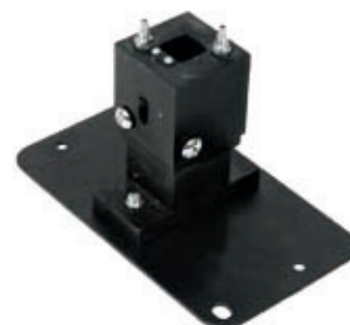
Cat. No. 18900335 10mm water-jacketed (for SCI-V1100 & SCI-UV1100)