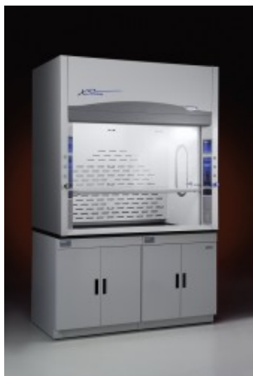
Catalog Number: 110410020