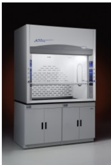
Catalog Number: 110410000