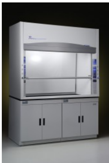
Catalog Number: 100600020