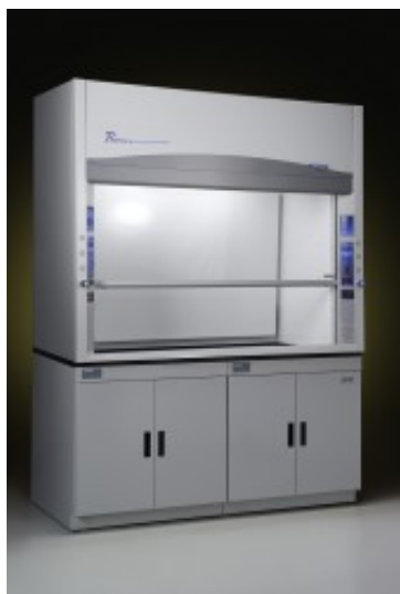
Catalog Number: 100600000