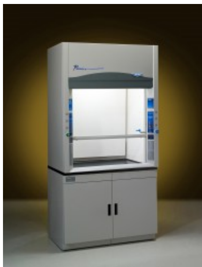
Catalog Number: 100400021