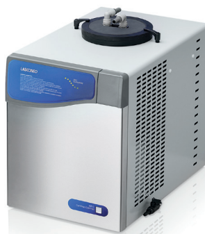
CentriVap -84° C Cold Trap