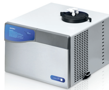
CentriVap -105° C Cold Trap